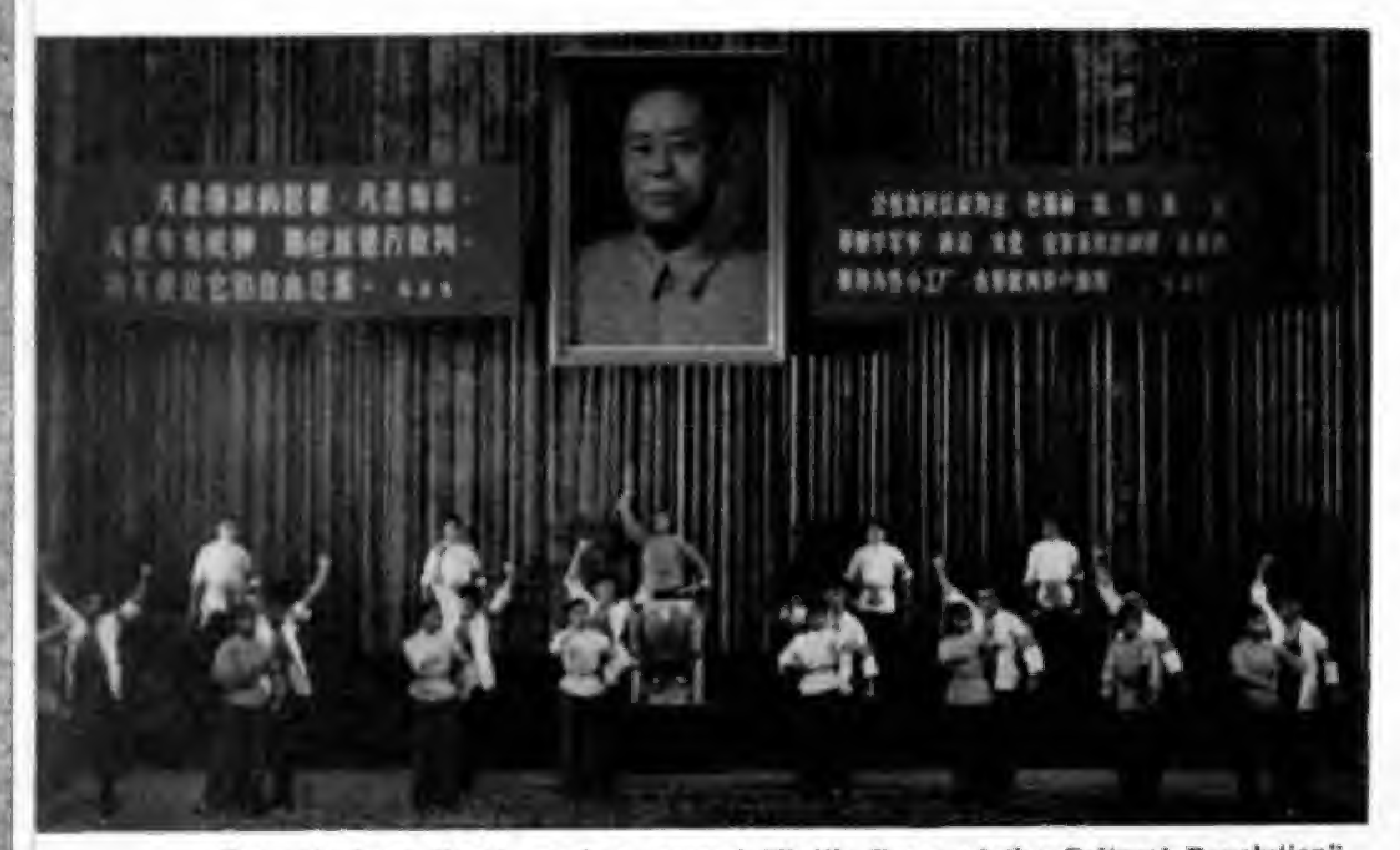
Peasants from Hopei province present "Battle Drum of the Cultural Revolution".